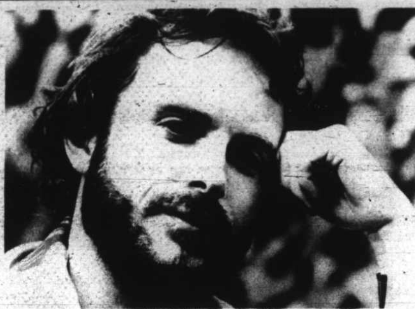
UPB AND RESIDENCE COUNCIL will be presenting Jean-Luc Ponty in concert this Monday at 8 p.m. in the Union Ballroom. Tickets are on sale now at the Union Information center, $2.50 in advance and $3.00 at the door.

Real fans will find more than many sci-fi writers in these pages: John W. Campbell, late editor of Analog magazine; Sam Merwin, H.G. Wells, Jules Verne, Hugo Gernsbeck, Jack Williamson and on and on. A total list of authors mentioned here would read like the canon of saints.