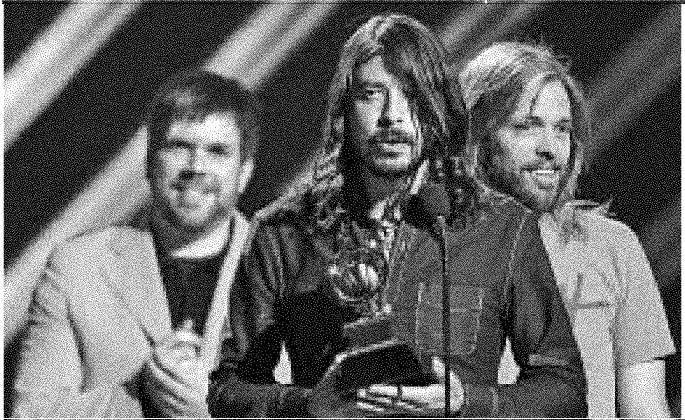
The Foo Fighters won best rock album.