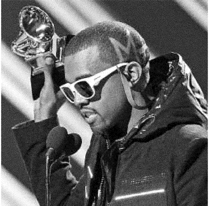
Kanye West accepts his award for best rap album for Graduation.