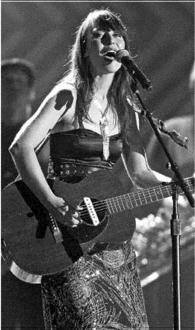
Calgary-based best new artist nominee Feist performs 1234.

tween R&B singer Alicia Keys and an old video of Frank Sinatra, and a Cirque du Soleil visual spectacular set to The Beatles' A Day in the Life , the only way to get a true sense of the year in music was to drill through the list of the winners and losers in the numerous non-televized categories.