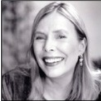
Self-produced cover art

Prince Tom Rush Buffy Sainte-Marie Sufjan Stevens James Taylor Dave Van Ronk Cassandra Wilson Paul Young