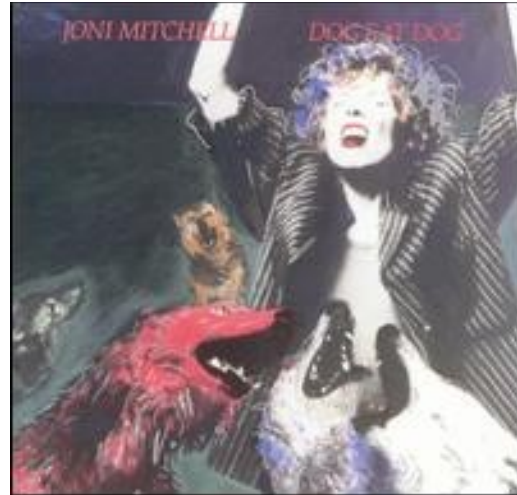
Dog Eat Dog (1985) ... her best '80s album

There even are hints of the reflective, adventurous and sometimes percussive acoustic-guitar work that shaped key works like Hejira , while some of the sinuous singing and playing and the delicate but clever arrangements recapture some of the unusual glory of The Hissing of Summer Lawns . ■