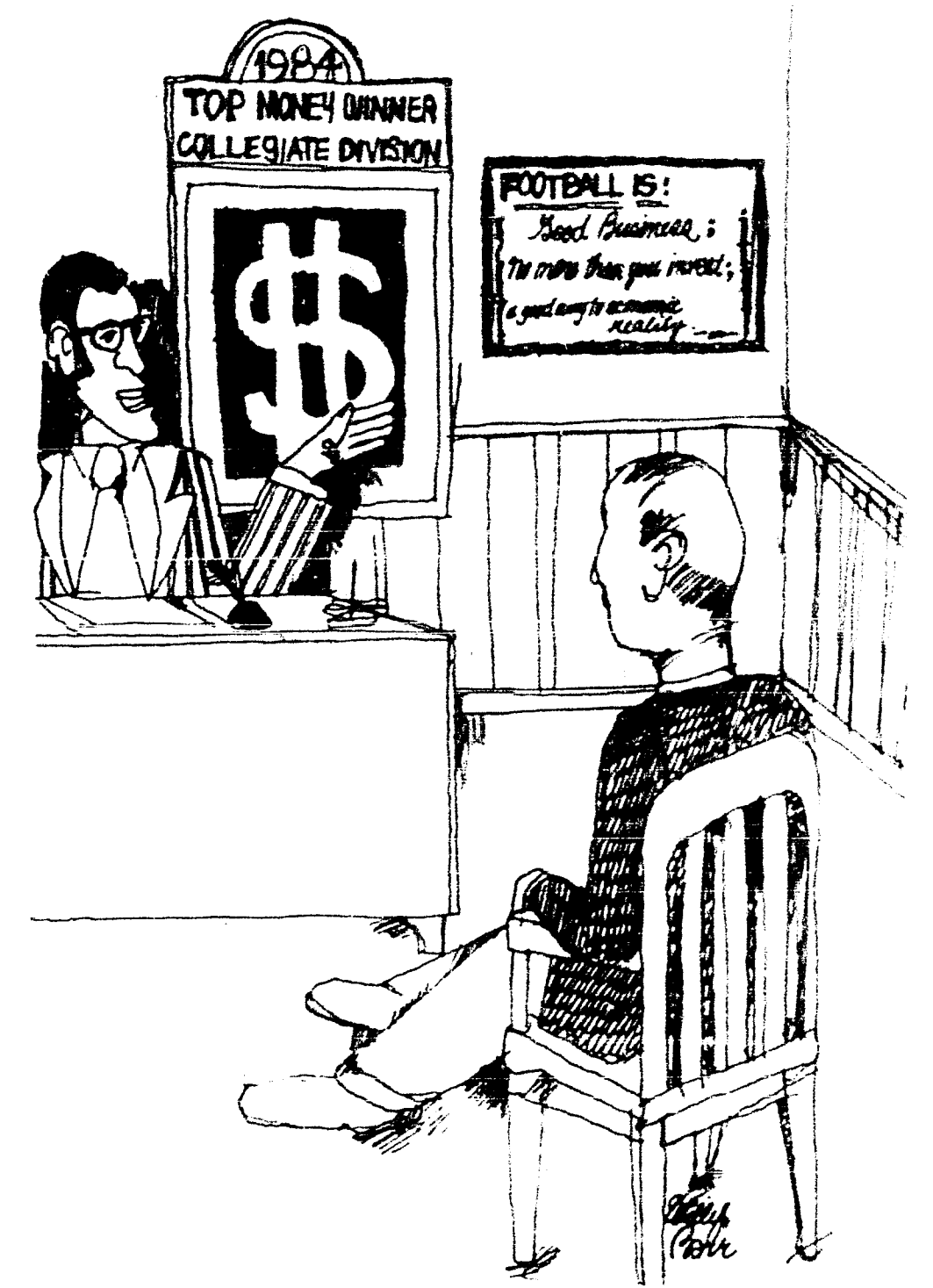
Sorry coach, but we feel the "team" would be better off more efficient man in your spot—we need a hard economist more than we need a "builder of men."

The future is tomorrow, the future is today. And SMU has been given a taste of the future of winning. With our recent near victory in basketball and with the excellent recruiting in football SMU smells championships in the air. The question remains though, will SMU pump millions of dollars into these sports? Will our players be shot full of pain killers when they are injured? Will the not so intelligent athlete be given special consideration at grade time? Will the games that little boys play be turned into inhumane businesses of big boys? Is it really winning that counts or is it how you play the game?