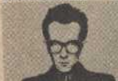
Elvis on stage in L.A.

Elvis Costello 8 DeShannon 17 Elvis Costello 29