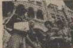
Fear & Loathing in Bay City, Michigan by Lester Bangs