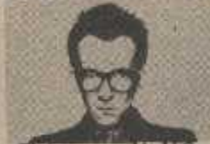
Elvis on record in U.S. by Lester Bangs