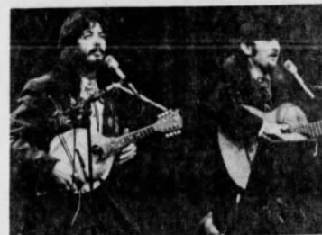
SEALS AND CROFTS: June 20-21.

The legalization of gambling and subsequent rise of