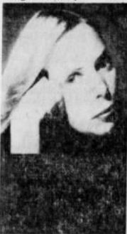
JONI MITCHELL: Aug. 22

May 14-15 RED OAK MUSIC THEATER — Will hold auditions for "Rodgers and Hart Celebration," a summer musical review, and Cole Porter's,