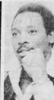
GEORGE BENSON: Aug. 27