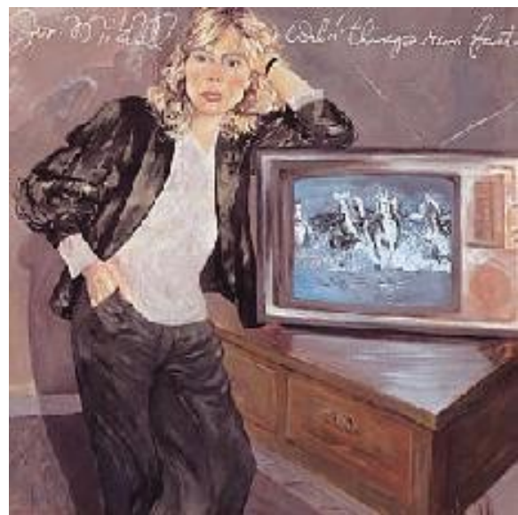
After a three-year hiatus, Mitchell returned to the limelight with her promising, but mixed offering of 1982, Wild Things Run Fast

Moon at the Window is fluid jazz-pop, while Chinese Café , with its "nothing lasts for long" refrain, captures her sad-joyous realisation of standing alone on the threshold of middle age. The album reaches a moving finale with Love , a jazz-pop adaptation of verses from Chapter 13 from the first Book of Corinthians in The Holy Bible . Although the explicit religious symbolism and archaisms were eliminated, Mitchell preserved the intrinsic beauty of the original verse.