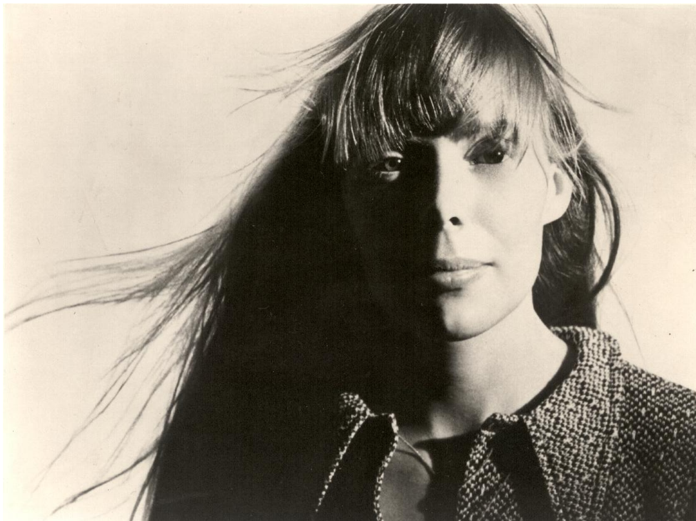
© Ed Thrasher - March 1968

Please send comments, corrections or additions to: simon@icu.com