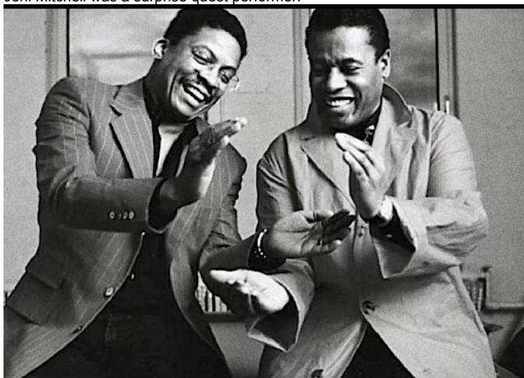
Herbie Hancock Celebrates Wayne Shorter

Joni Mitchell was a surprise quest performer.